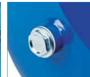
Internally Coated Receiver