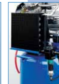
After Cooler & Coalescing Filter