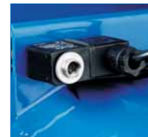
Soft Start Valve